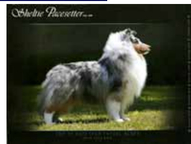
(The above are some examples of our newly-reduced magazines.)

Email me (before April 8th) a list of those back issues you're purchasing, and we'll bring them to you at the St. Louis National Specialty—thus saving you the p&h costs!